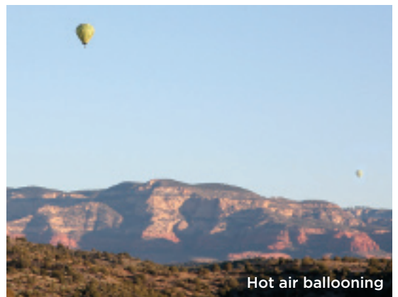
Hot air ballooning

S EDONA IS 10,500 FEET BELOW - WRINKLED, BEIGE and reddish, like satellite photos of Mars. Karl Priggee is trying to distract us from the fact that we're in a seatless biplane that feels as aerodynamic as a tin can and that, even more worrisome, we won't be landing in said plane but falling out of it face first.