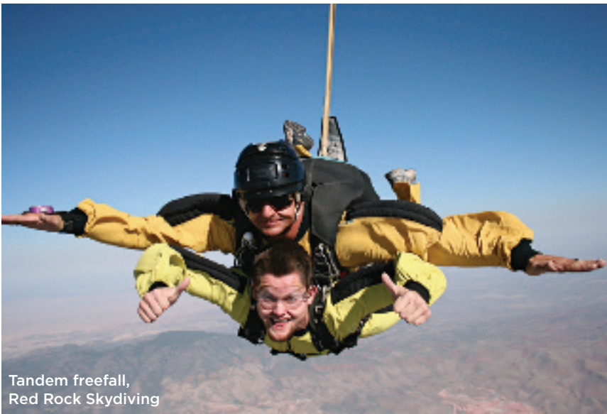
Tandem freefall, Red Rock Skydiving